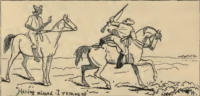
"Having missed - I remount"